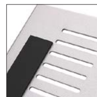
Anti-vibration pads hold laptop securely while vents assist in cooling.