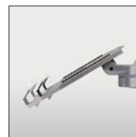
Accommodate laptops up to 15.4".

Reinforced steel construction with anti-vibration pads ensure that your laptop is stable and quiet while the vented platform design allows your laptop to stay cool. The Workrite Universal Laptop Holder ships completely assembled. Simply adjust the laptop holder height to match your laptop computer's size, attach to any 75 mm VESA compliant monitor arm with the provided screws, and get to work.